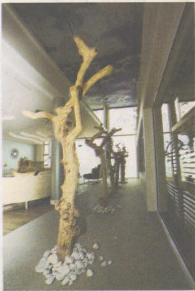
STICKS AND STONES: Coffee trees from India and floating glass birds create an intriguing installation in the hotel foyer

A FLIGHT of birds wafting under a cerulean sky. A shoal of brightly coloured fish floating through a mobile chandelier spanning three storeys. Fish swimming across walls. Bleached trees rising to the ceiling — there are so many eye-catching details that make The Views Hotel in the Wilderness, outside George, one of the most enthralling design finds to come under our radar.