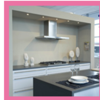
Kitchen with Cannata Second.Life in Misty White